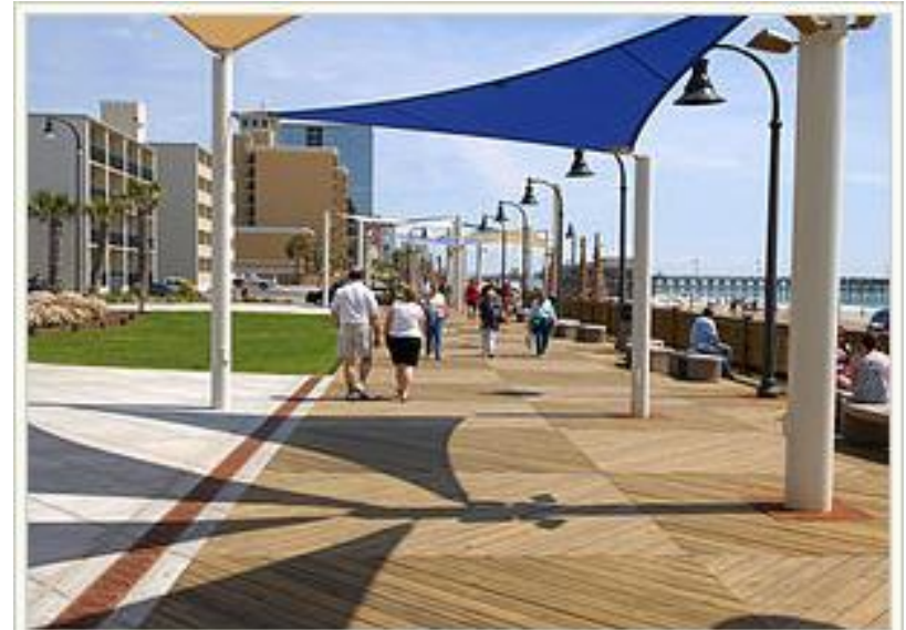
Myrtle Beach Boardwalk