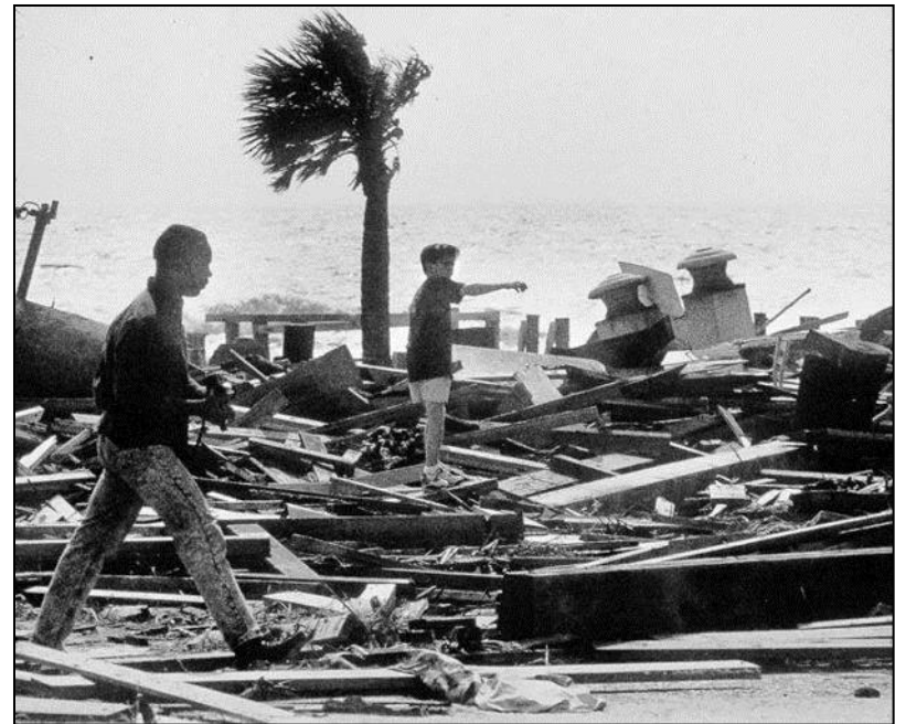
Myrtle Beach Post Hugo, 1989