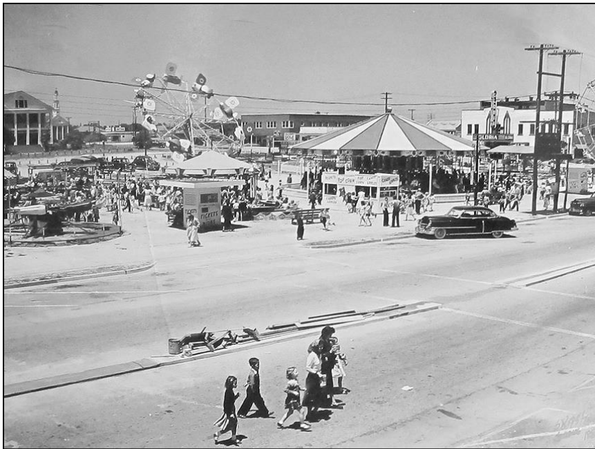
1954, Ocean Drive, Myrtle Beach