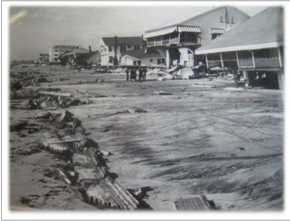
Myrtle Beach Post Hazel, 1954