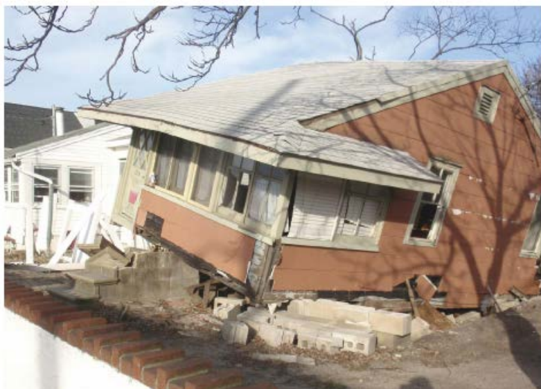
1-story, timber, pre-1961