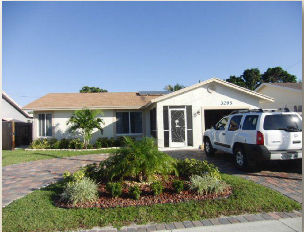
Broward County Built 1978 Square Foot 1475